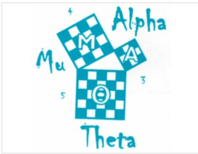
National Honor Society